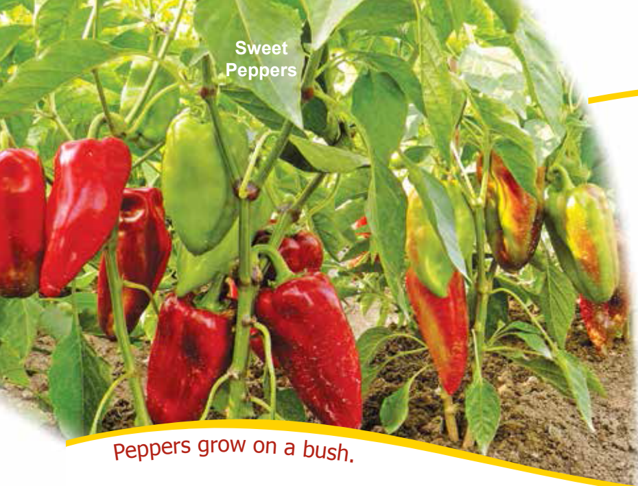
Peppers grow on a bush.