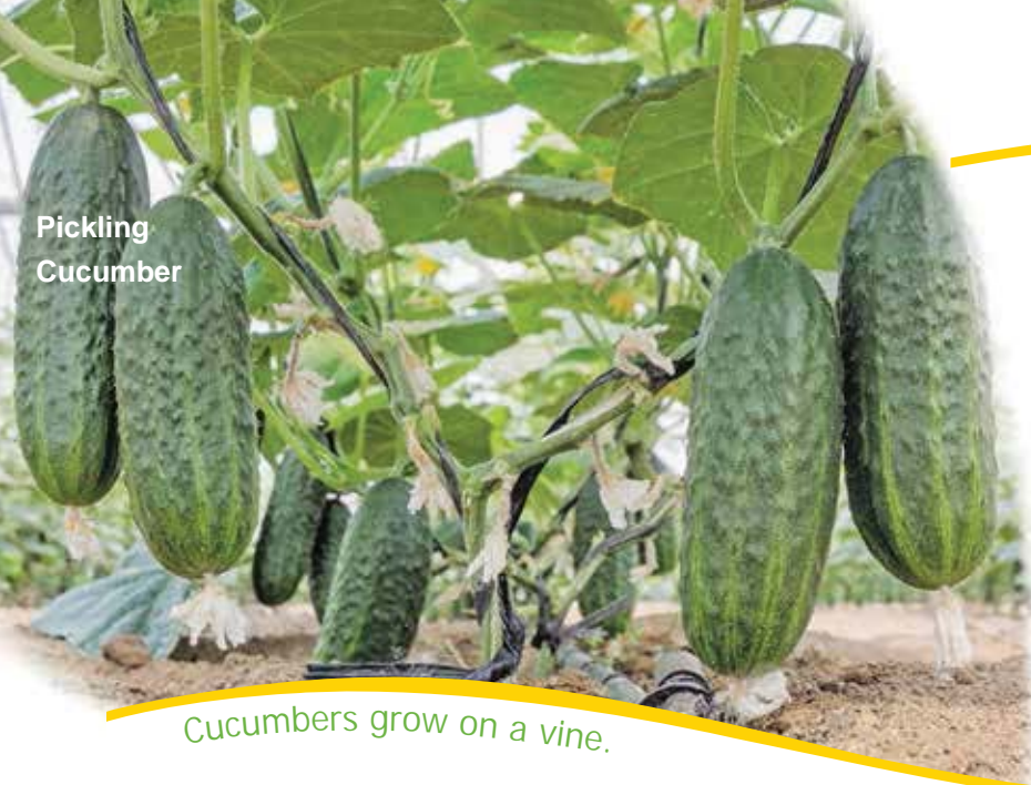
Cucumbers grow on a vine.