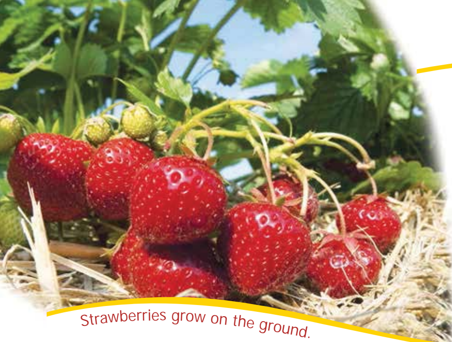
Strawberries grow on the ground.