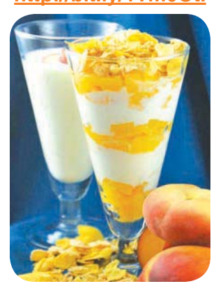
Peachy Parfait http://bit.ly/1Tm0Otl

Decide with your group which scene you would like to work on. What are the barriers? What are the opportunities? As a group, decide what you would say and do. You can either write it down or present your solution in front of the class by performing a short skit. Compare solutions with different groups.