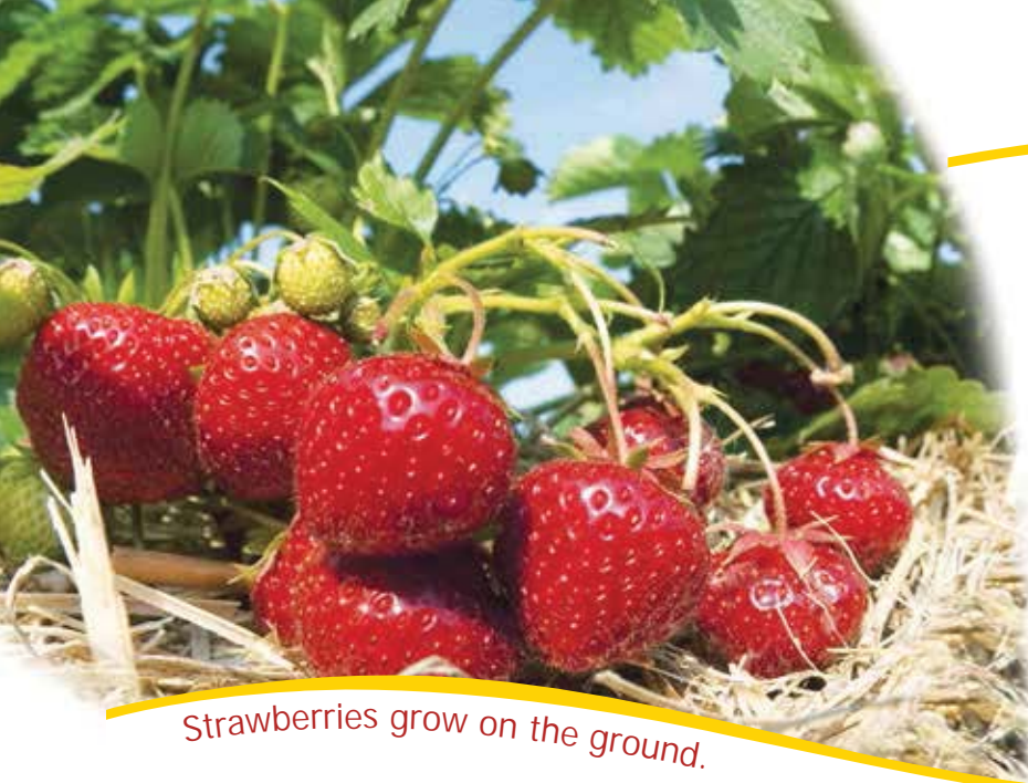
Strawberries grow on the ground.