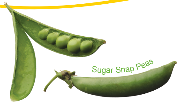
Sugar Snap Peas

■ Read the sentence and write the sentence below it.