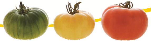
Tomatoes grow on a bush.