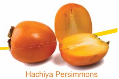
See the Persimmon Apple Delight recipe in Tasting Trios .