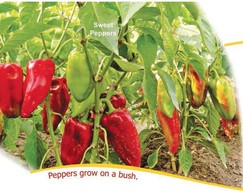
Peppers grow on a bush.