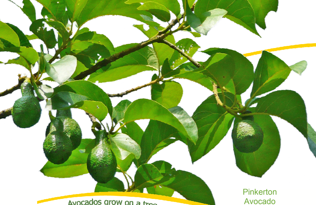
Avocados grow on a tree.