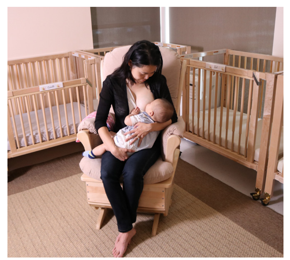
Figure 2: Breastfeeding Space in a Childcare Center

Figure 1 highlights a breastfeeding space set up in the living room of a family childcare home. The space includes comfortable seating as well as soft lighting. If families prefer more privacy, there is a folding screen, pictured on the right, that can be set up and taken down easily. As shown, when not in use, the screen can be folded up and placed next to the chair. The small side table presents a space for a glass of water or to display breastfeeding resources.