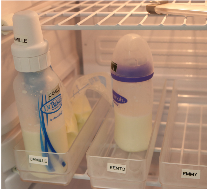
Figure 3: Breast Milk Storage in a Family Childcare Home

Figure 3 highlights breast milk storage in a family childcare home. A section of the standard refrigerator is designated to store breast milk. It is permitted to store breast milk in a home refrigerator alongside other food and drinks. Breast milk is being stored in bottles and bags and organized in trays clearly labeled with the child's name. The bottles and bags are also labeled with each child's name and date milk was expressed. The container on the far left has several bags of milk behind it, emphasizing that the milk in the bottle should be utilized first.