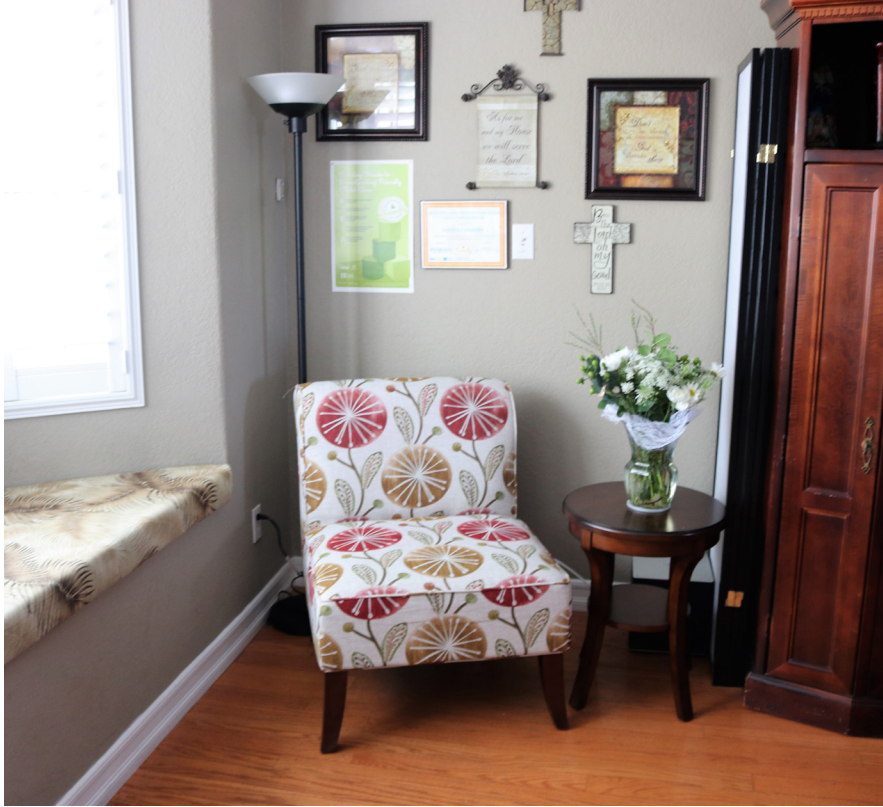
Figure 1: Breastfeeding Space in a Family Childcare Home

Figure 1 highlights a breastfeeding space set up in the living room of a family childcare home. The space includes comfortable seating as well as soft lighting. If families prefer more privacy, there is a folding screen, pictured on the right, that can be set up and taken down easily. As shown, when not in use, the screen can be folded up and placed next to the chair. The small side table presents a space for a glass of water or to display breastfeeding resources.