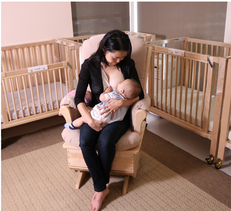
Figure 2: Breastfeeding Space in a Childcare Center

Figure 1 highlights a breastfeeding space set up in the living room of a family childcare home. The space includes comfortable seating as well as soft lighting. If families prefer more privacy, there is a folding screen, pictured on the right, that can be set up and taken down easily. As shown, when not in use, the screen can be folded up and placed next to the chair. The small side table presents a space for a glass of water or to display breastfeeding resources.