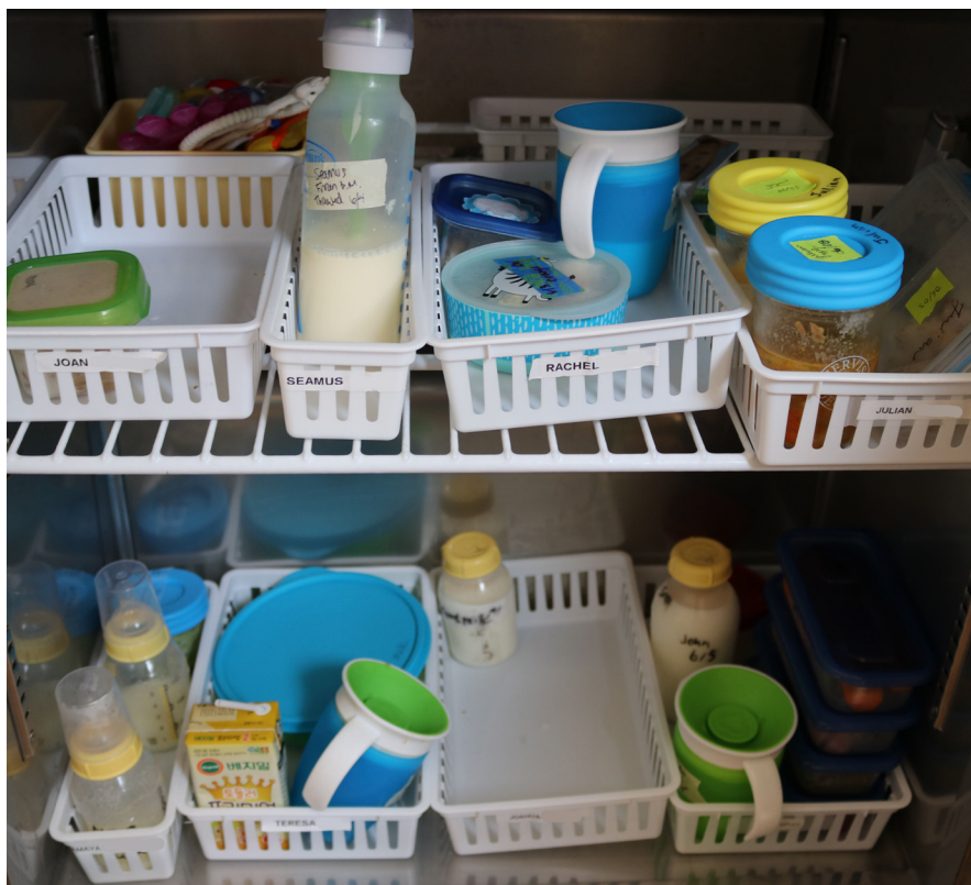
Figure 4: Breast Milk Storage in a Childcare Center

Figure 3 highlights breast milk storage in a family childcare home. A section of the standard refrigerator is designated to store breast milk. It is permitted to store breast milk in a home refrigerator alongside other food and drinks. Breast milk is being stored in bottles and bags and organized in trays clearly labeled with the child's name. The bottles and bags are also labeled with each child's name and date milk was expressed. The container on the far left has several bags of milk behind it, emphasizing that the milk in the bottle should be utilized first.