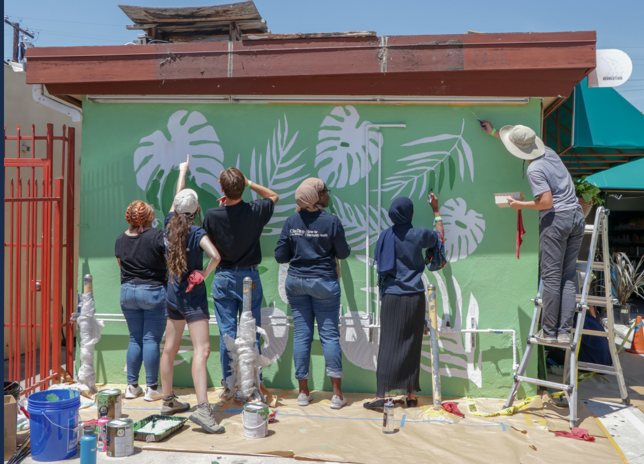
Center City Market, City Heights UC San Diego Youth Advisory Council