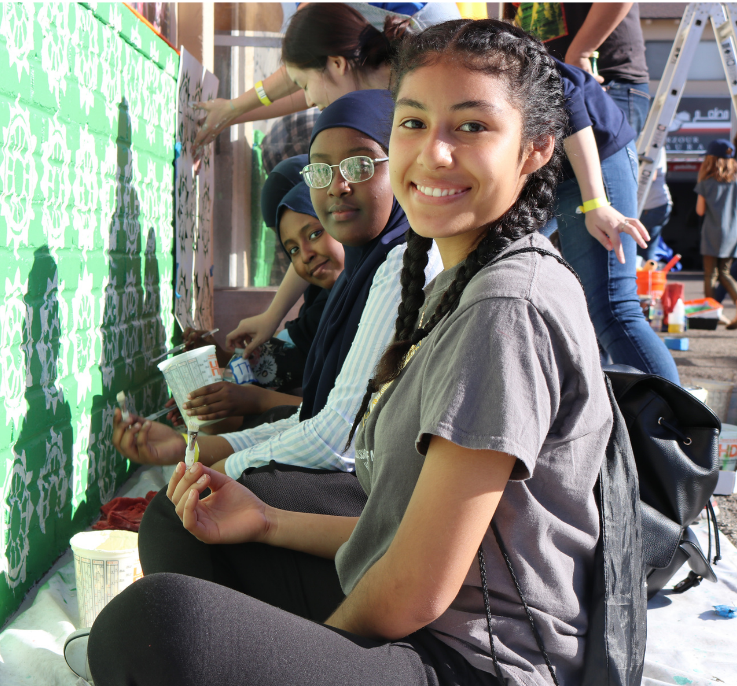
Rema Halal Foods El Cajon, 2017

Funded project of the County of San Diego Health & Human Services Agency. This work supports Live Well San Diego, the County's vision for a region that is Building Better Health, Living Safely, and Thriving. For CalFresh information, call 2-1-1. Funded by the USDA SNAP, an equal opportunity provider and employer. Visit www.calfreshhealthyliving.org for healthy tips.